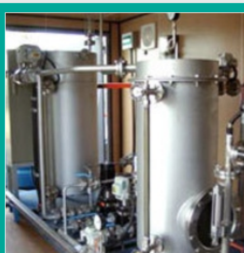
Arsenic Removal Plants