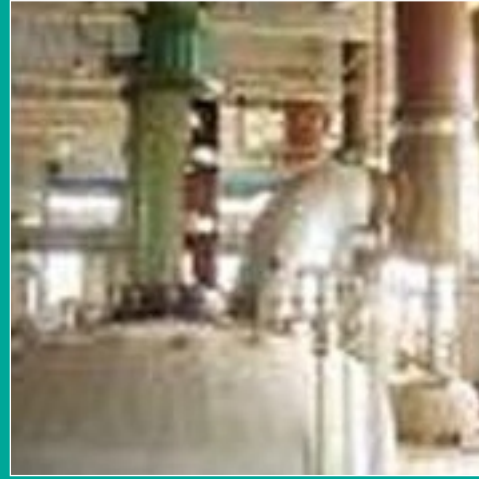
PVAC Adhesive Plant