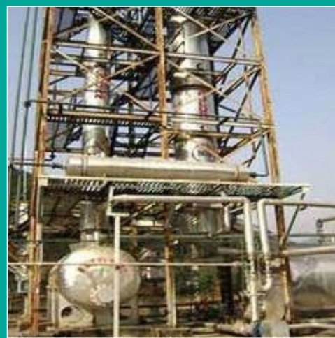
Oil Reconditioning Plant