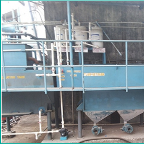
Industrial ETP Plant