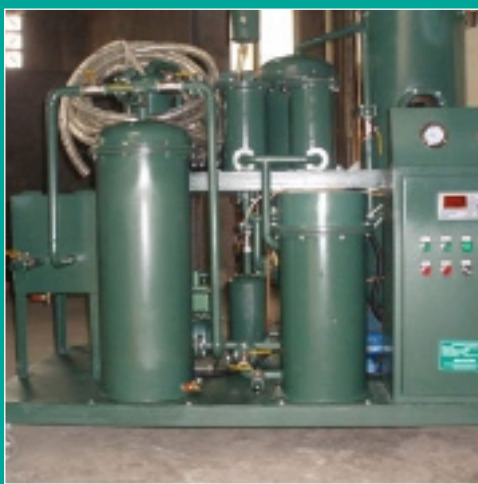
Used Oil Reconditioning Plant