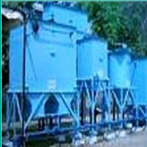
Effluent Treatment Plant