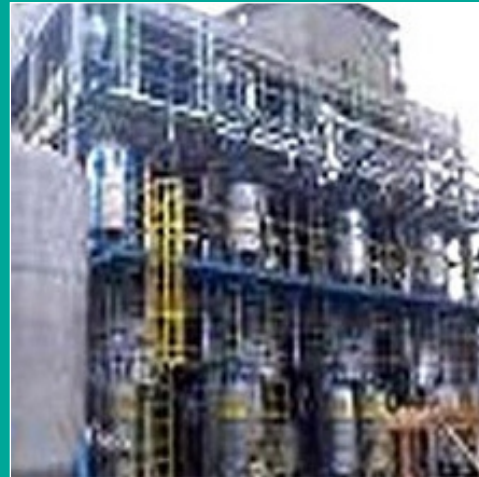
Acrylic Resin Plant