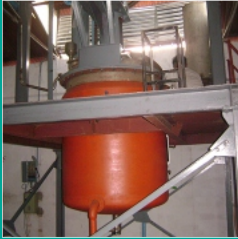
Industrial Adhesive Making Plant